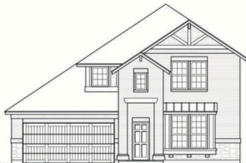
NORAH - ELEVATION B