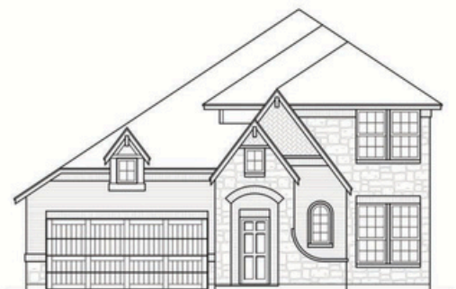
NORAH - ELEVATION C