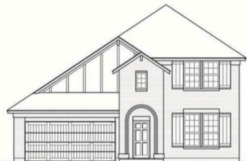
NORAH - ELEVATION A