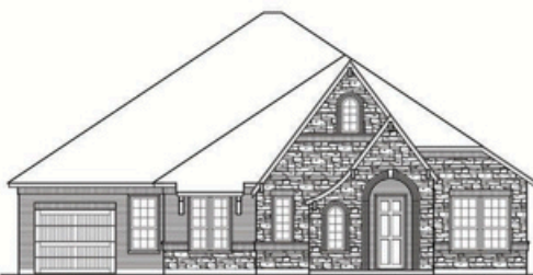
BRYNLEIGH - ELEVATION B