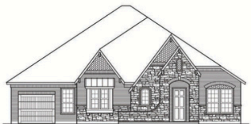
BRYNLEIGH - ELEVATION C