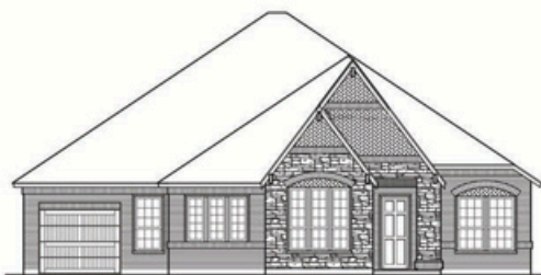
BRYNLEIGH - ELEVATION A