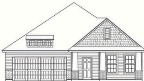
ABIGAIL - ELEVATION B