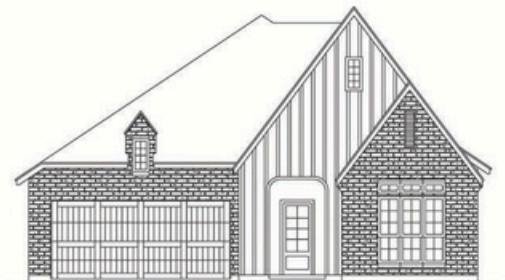
ABIGAIL - ELEVATION C