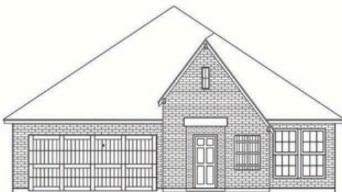
ABIGAIL - ELEVATION A